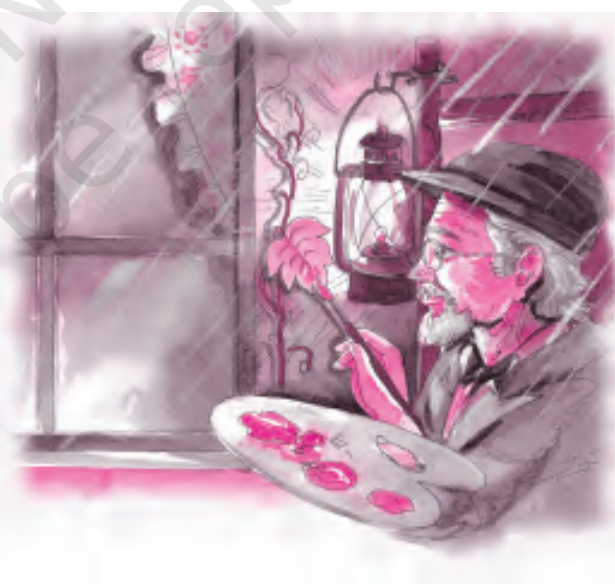
The Last Leaf/ 47

The next morning Sue came and sat on Johnsy's bed. Taking Johnsy's hand in hers she said, "I have something to tell you. Mr Behrman died of pneumonia this morning. He was ill for only two days. The first day the janitor found him on his bed. His clothes and shoes were wet and he was shivering. He had been out in that stormy night."